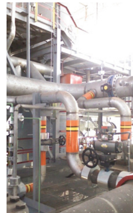
Figure 2: Bypass Piping – Side View