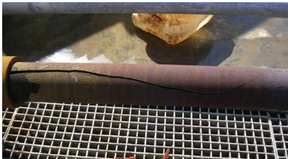
Figure 1: Oleum cracking on discharge of pump.

Figure 1 shows an example of oleum cracking. When a pump designed for strong acid service is installed in oleum service, oleum cracking could occur. The discharge pipe of the acid pump is constructed of grey