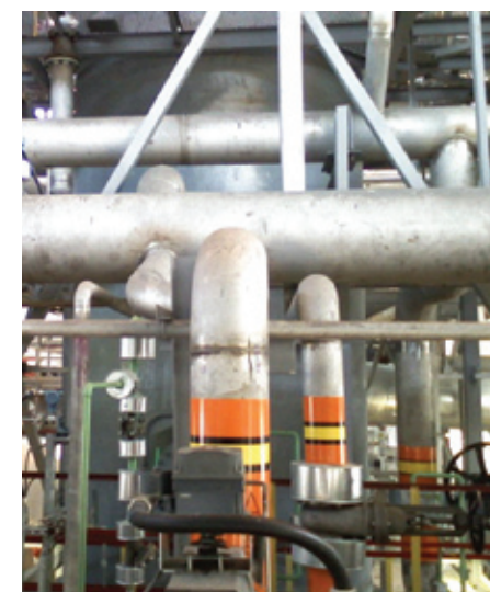
Figure 3: Bypass Piping – Front View

combined streams ahead of the location of instrumentation. Improper instrument locations can lead to poor control and/or costly re-work.